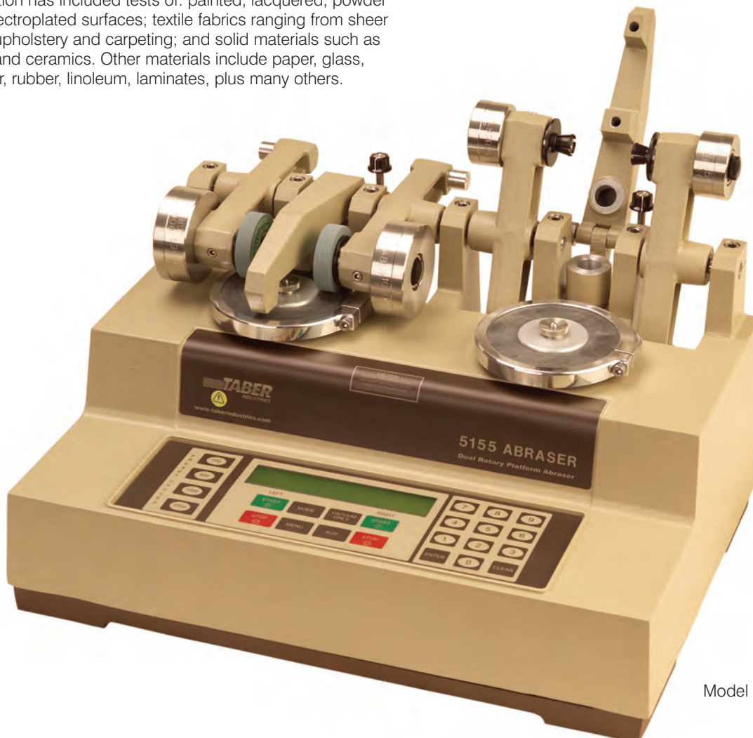
Model 5155 Shown